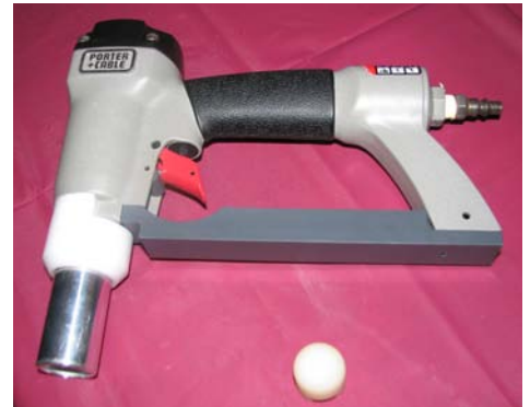
Zephyr Pneumatic Stun Gun

This device was distributed by the Ontario Farm Animal Council (OFAC) to abattoirs across Ontario in 2005 to enable them to meet new Meat Regulations prohibiting the use of blunt trauma to stun rabbits in Ontario. Abattoir owners could apply for a refund of 50% of the value of the Zephyr from OMAFRA.