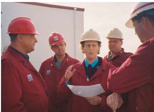
Dr. Grandin conducting an Alberta meat plant audit